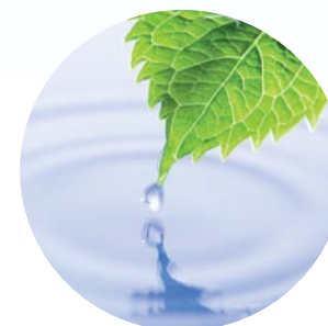
Healthy for you, your family and the environment.