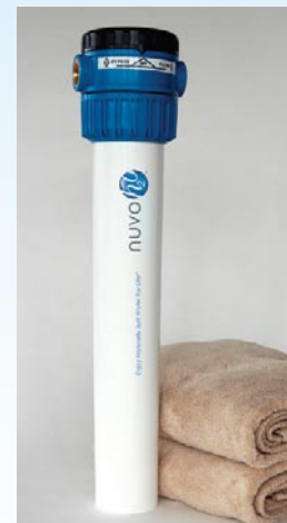
Amazingly small—perfect for apartments, condos and other limited spaces.